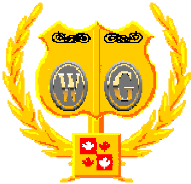
Figure 1. Adhesive here