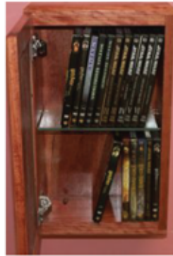
MC-418 depicted here in Sedona Red Stain.