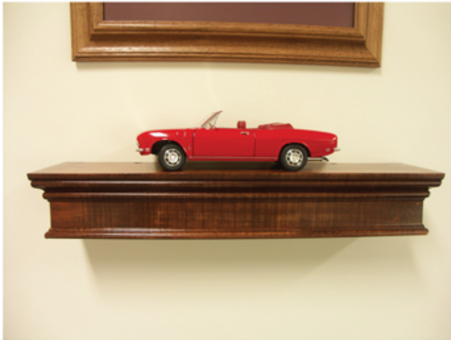
MS-1 depicted here in Gloss Black Enamel.