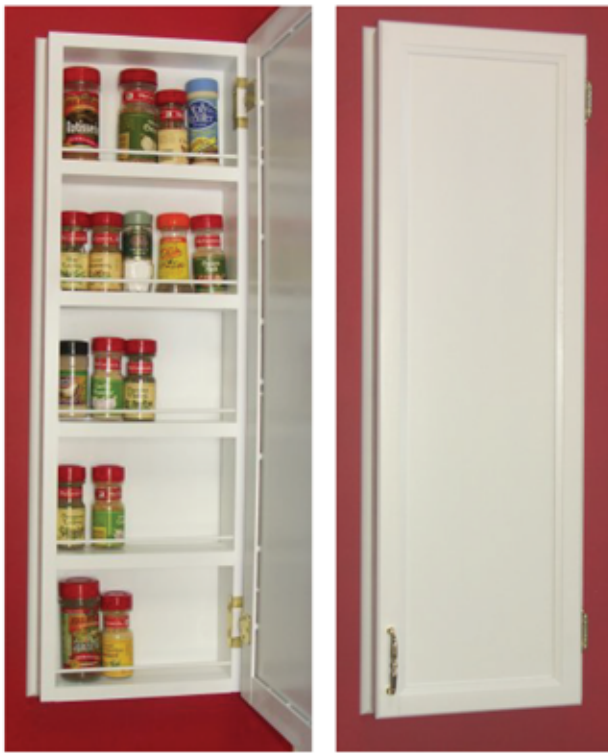
SC-248 depicted here in Gloss White Enamel.