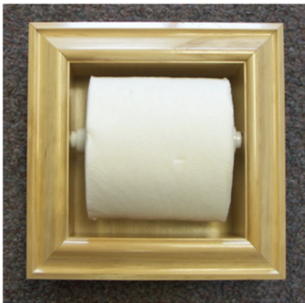
TP-1 depicted here in Natural Maple Stain (Clear Gloss).