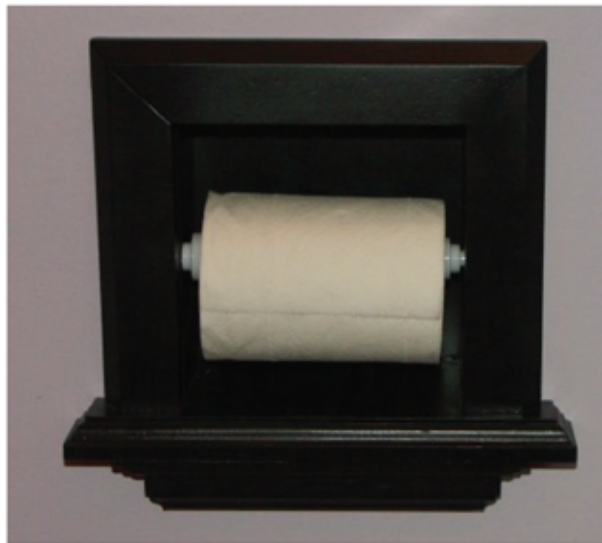
TP-10 depicted here in Satin Black Enamel.