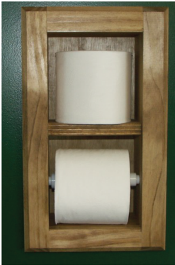
TP-12 depicted here in Special Walnut Stain.