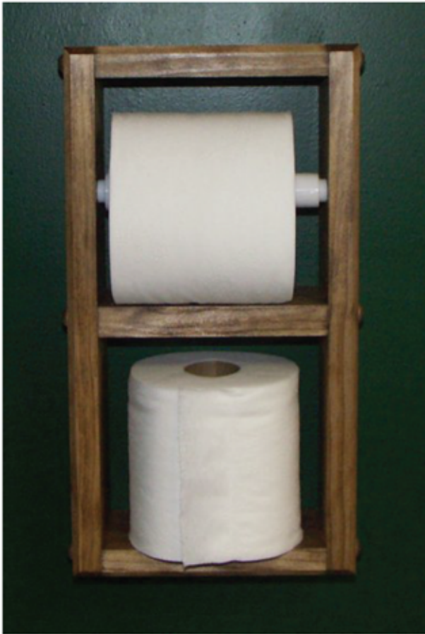
TP-13 depicted here in Early American Stain.