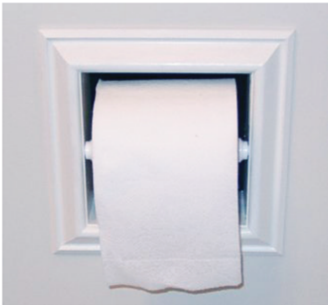
TP-14 depicted here in Gloss White Enamel.