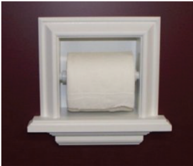
TP-2 depicted here in Gloss White Enamel.