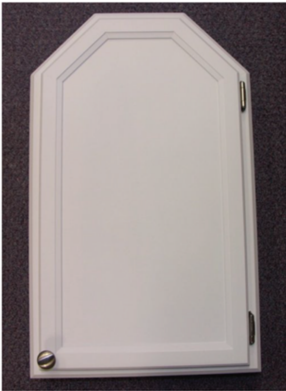
WC-12 depicted here in Satin White Enamel.