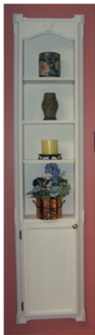
Optional Cabinet Module.

BKC-1 depicted here in Satin White Enamel.