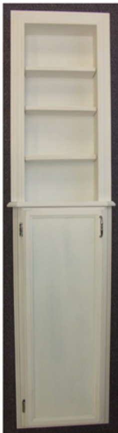
BKC-2 depicted here in Gloss White Enamel.