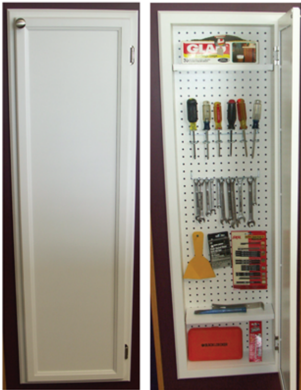
GC-148 depicted here in Gloss White Enamel.