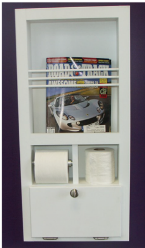
MR-10 depicted here in Satin White Enamel.