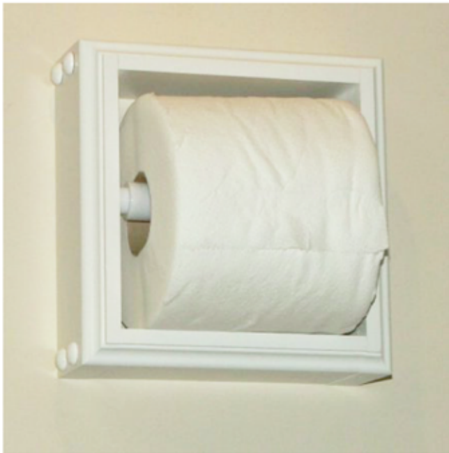
TP-11 depicted here in Gloss White Enamel.