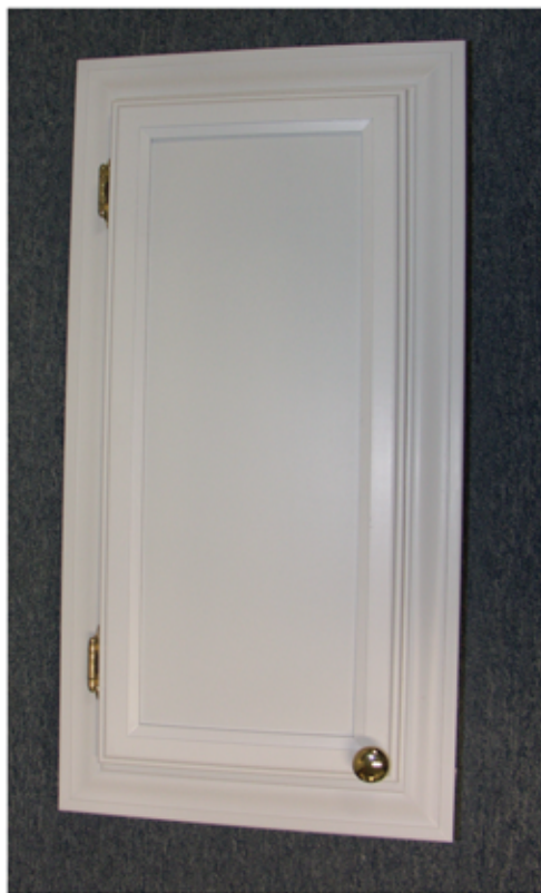
WC-1 depicted here in Gloss White Enamel.