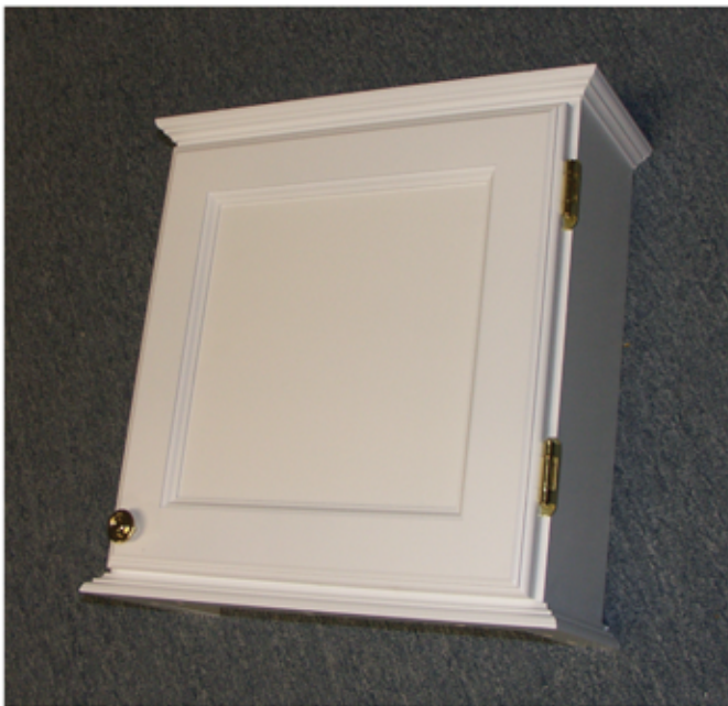
WC-218 model depicted in Gloss White Enamel.