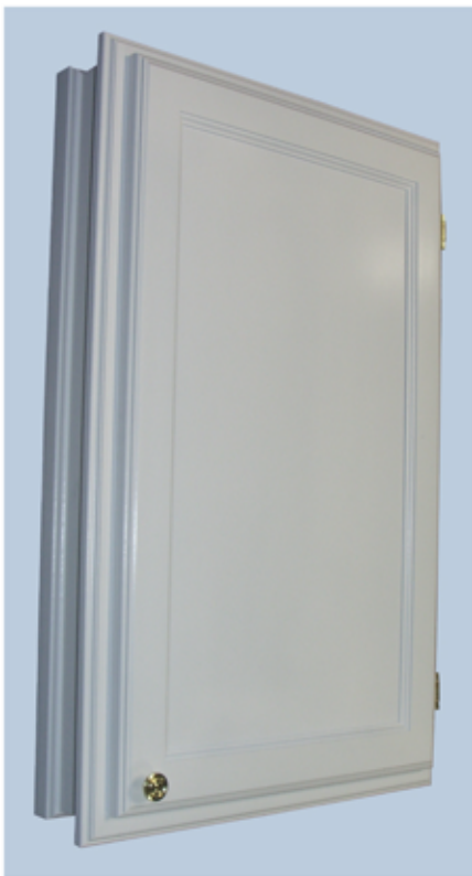
WC-524 depicted here in Gloss White Enamel.