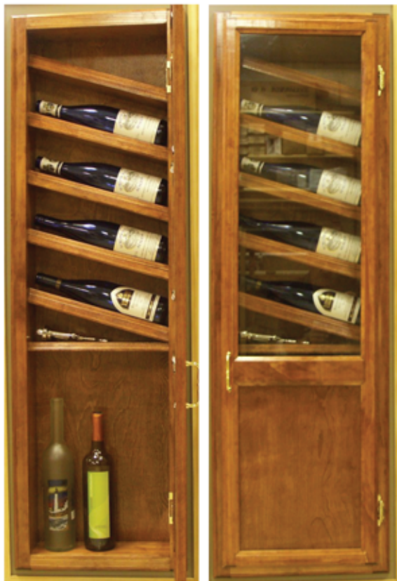
WC-524 depicted here in Red Chestnut Stain.