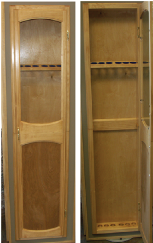
WC-9 depicted here in Ipswitch Pine Stain.